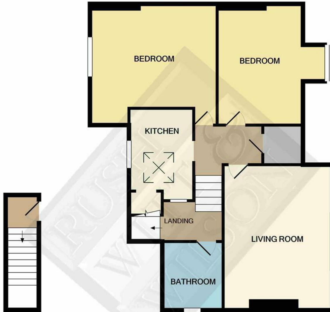
ENTRANCE FLOOR APPROX. FLOOR AREA 46 SQ.FT. (4.3 SQ.M.)